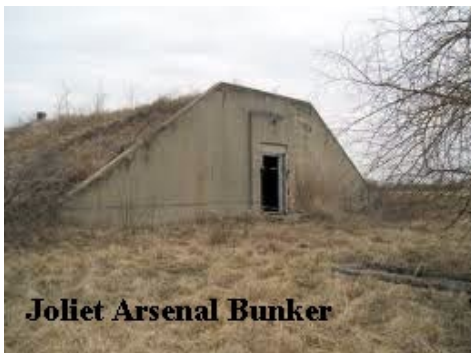
Joliet Arsenal Bunker

Forest Service signs at intervals beside the trail did provide information, although some were hard to read from weathering. The signs (supplemented by research after our walk) explained that this area of about 40,000 acres had been farmed by some of the earliest pioneers in Illinois, who sod-busted the original prairie and plowed deep furrows that impacted roots and led to erosion. In 1940-41 the US Army bought the land and cleared about 450 small farms to set up the Joliet Arsenal, which was used through World War II and later reactivated during the Korean and Viet Nam Wars.